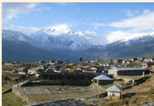
Barpak Village, Nepal.

In 1991, Barpak Village in Nepal's mountainous Gorkha District was electrified with a 50 kW hydro plant owned and operated by a private developer, Barpak Rural Electrification Pvt. Ltd. Users included two agro-processing mills, a furniture mill, bakery, video parlor to show films and a ropeway for transport. The plant was upgraded to 130 kW in 2004, providing continuous and affordable electricity to well over 1,000 households as well as businesses in Barpak and adjoining villages. The plant now also powers a cybercafé, mobile tower, and cable television. The area (and power plant) suffered severe damages when a 7.8 magnitude earthquake hit in 2015. At the time, Jit Bahadur Ghale, owner of the village hardware store and local representative of the Nepali Congress Party, commented that four things were required for repairs: "people, power, roads, and bank." In 2018, the hydropower system was rehabilitated and upgraded to 500-kilowatt. Potential new developments with the upgrade included a cold storage plant for vegetables, a milk-chilling unit, a nettle powder-processing plant, a Lokta paper factory, and other tourism-related services, including a water purification plant.