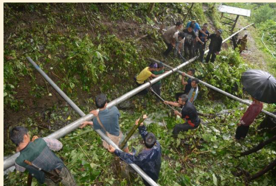
Community members installing the penstock

NEPeD manufactures and installs pico-hydro systems called Hydrogers (hydro and generator). Their Hydroger Systems are manufactured locally, making them available easily in the region. The low cost, lightweight, accessible operation, and versatile utility of the Hydroger systems have allowed widespread adoption. Besides Nagaland, over 50 units have been installed across northeast India, including Meghalaya, Sikkim, Manipur, Arunachal Pradesh, Maharashtra, and Jammu and Kashmir.