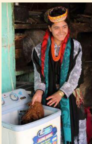
A woman from Sarujalik village uses a micro-hydro-powered washing machine.

The Sarujalik Village in the Bumburet Valley in northern Pakistan had always remained deprived of basic facilities. With no access to main-grid electricity, they mostly depended on diesel generators. In 2011, the Sarhad Rural Support Program (SRSP) designed and constructed a 200 kW mini-hydro system to be operated by the Sarujalik community. The system was later