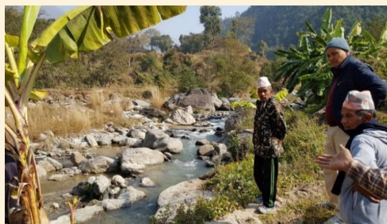
Syaurebhum community members.

In January of 2018, the Syaurebhum 23 kW micro-hydro system was connected to the national grid in Nuwakot, Nepal, making it the first grid interconnected MHP in the country, and opening the door for other MHP's to follow. This pilot project emerged from a government policy for grid interconnection of MHPs of less than 100kW capacity. The policy attempted to respond to the widespread abandonment of MHPs, which was occurring as the national grid expanded into previously off-grid service areas.