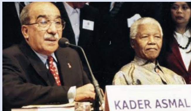
The IHA was never pleased by the outcomes of the World Commission on Dams.

2012- : HSAP “Sustainability Partners” begin to carry out HSAP Assessments