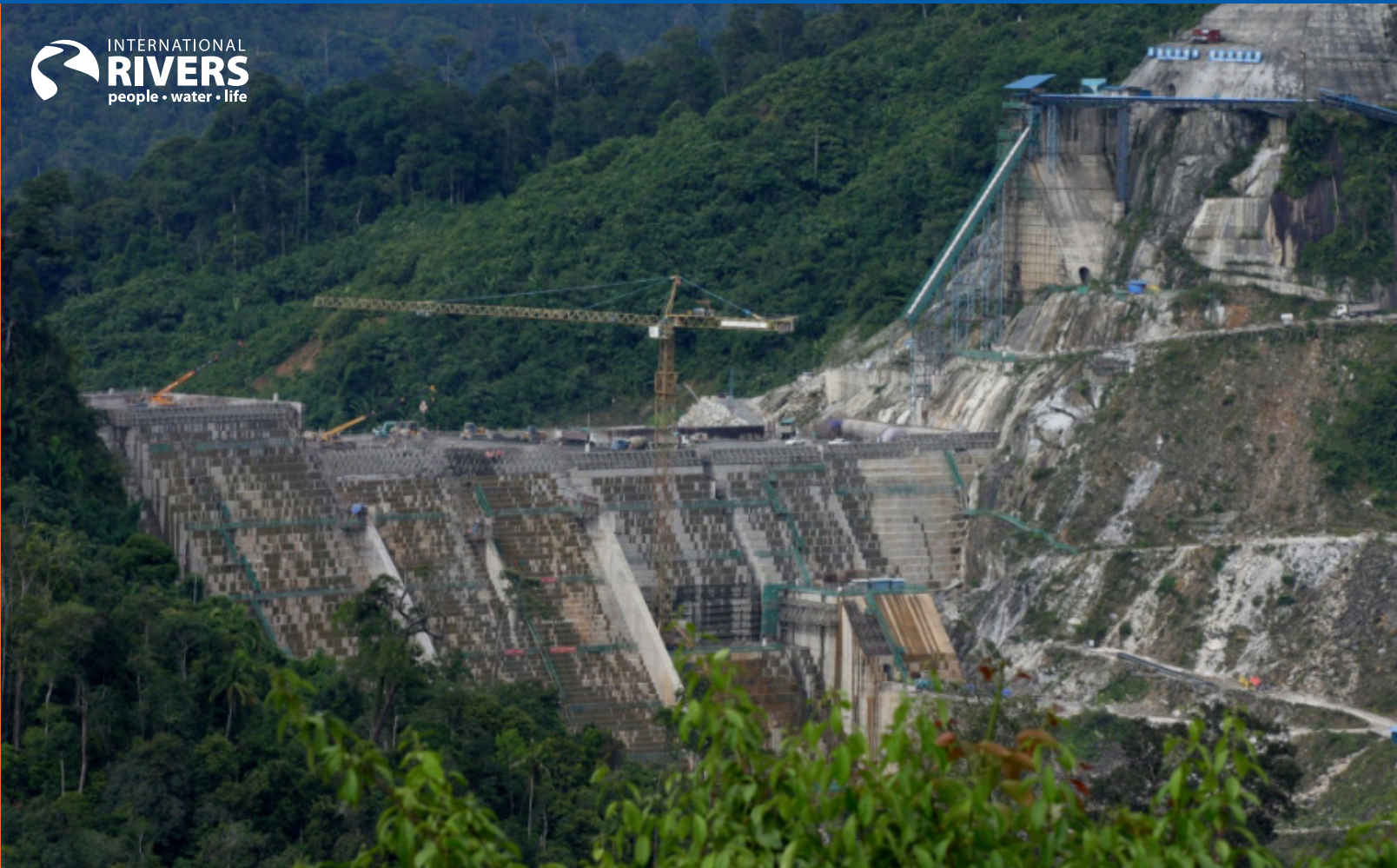
HSAP Sustainability Partner Sarawak Energy is building the Murum Dam, which will displace 1,500 indigenous people and flood vast areas of the Borneo rainforest.